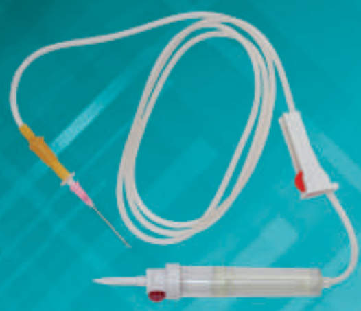
Pro -Fusion Delta